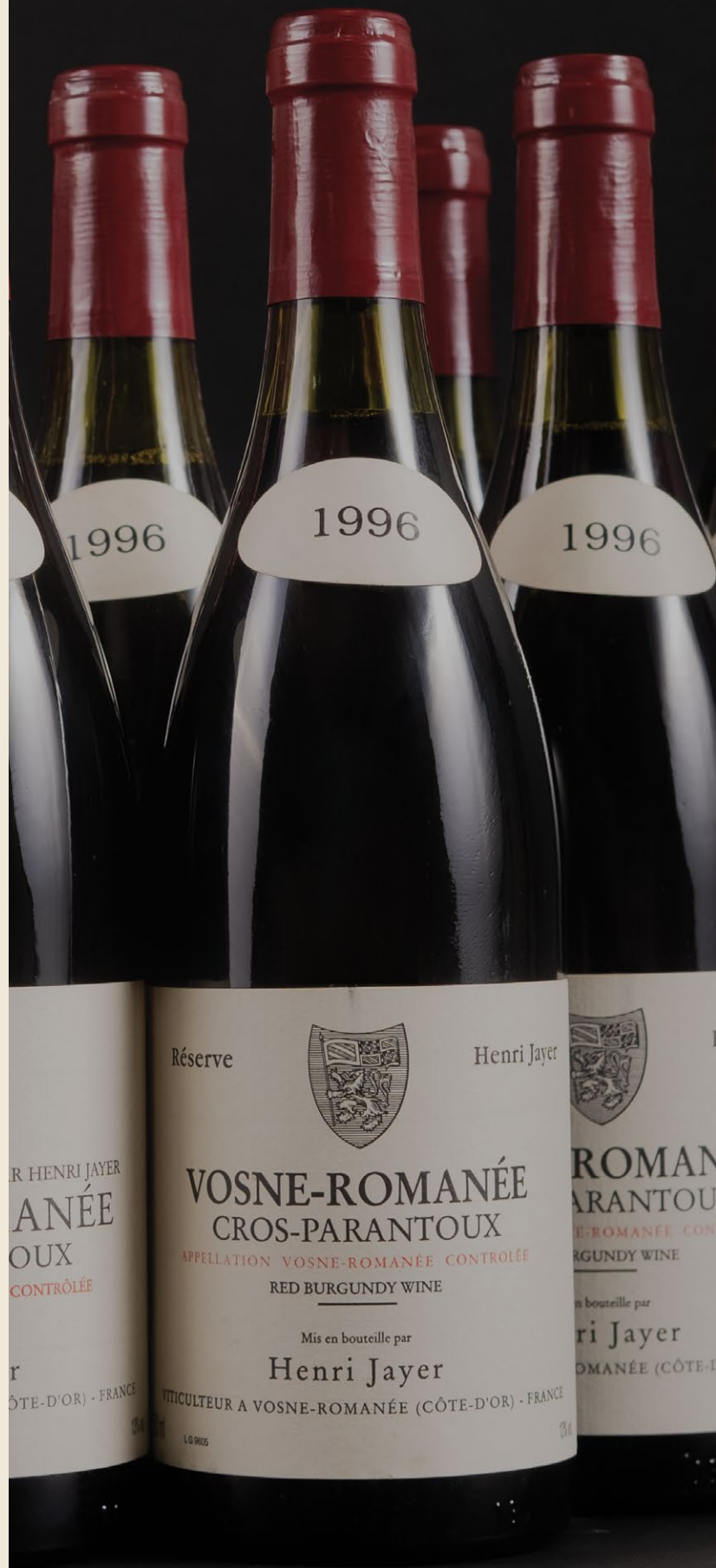
Vosne-Romanée Cros Parantoux Réserve 1996 $137,500 (12 Bottles)