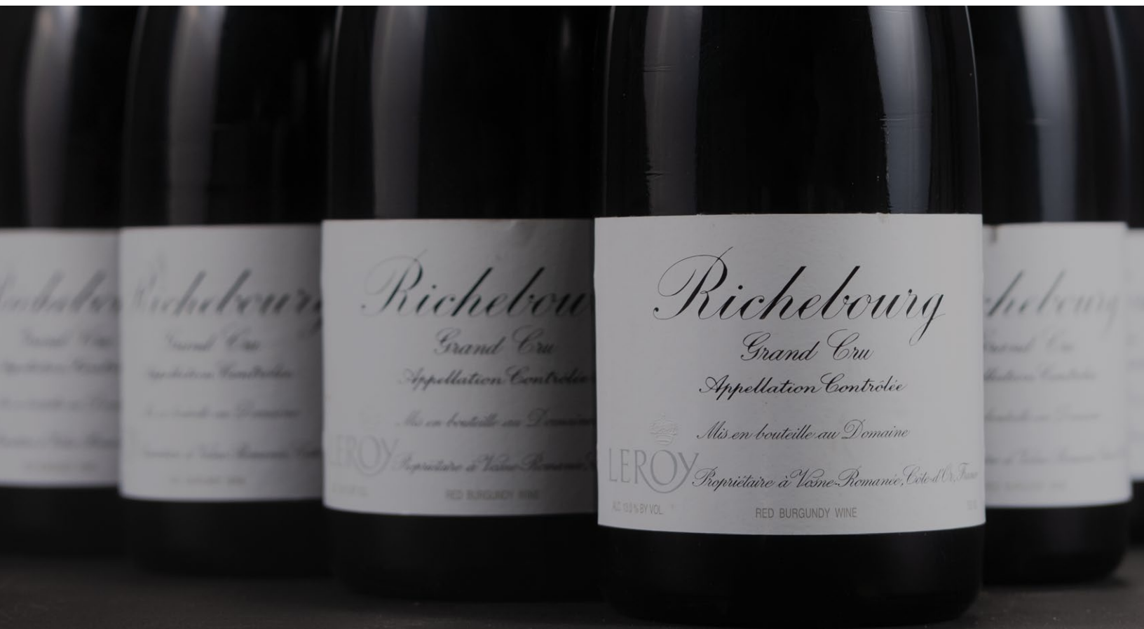
Richebourg Domaine Leroy 2001 | $87,500 (12 Bottles)

With potential tariffs looming, we're anticipating a repeat of the last time when auction prices soared due to taxes on imports. That, combined with expected deregulation...all the industry chatter is looking positive, which is why we've already got a January auction lined up with a single-owner sale, and a big start on late February and beyond.