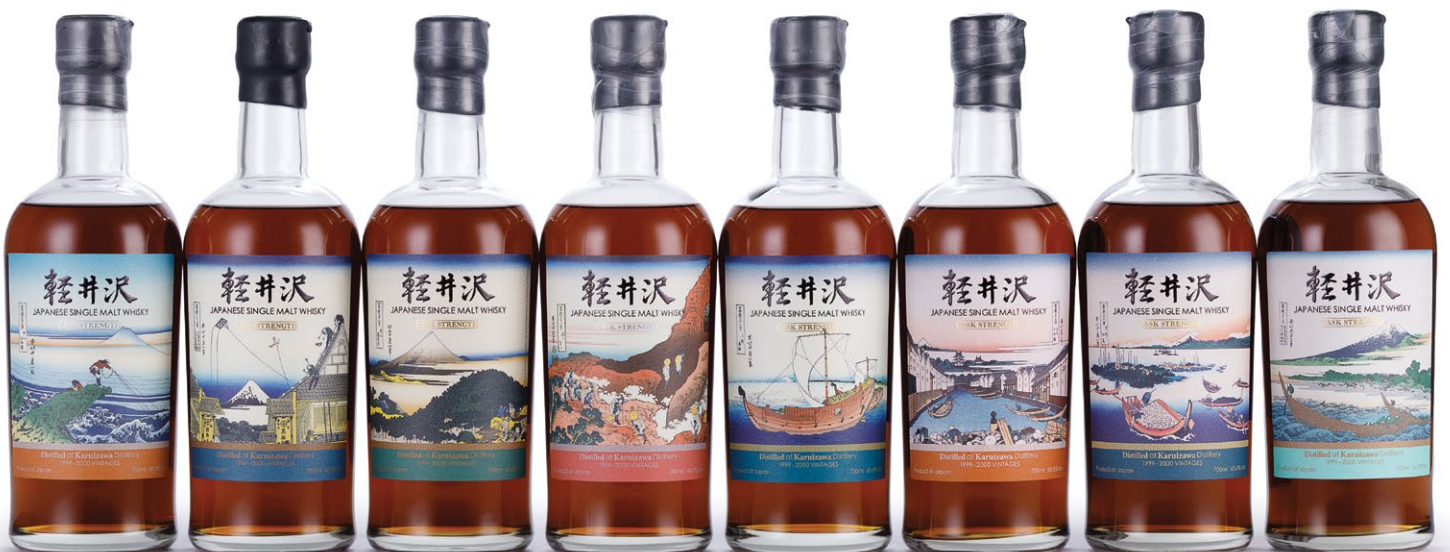
Karuizawa 36 Views of Mt Fuji Batch 1-16 Cask Strength 1999-2000 | $41,700 (16 Bottles)